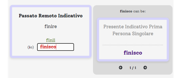
Figure 3: On the left side's card, see an example of the "Conjugation" task for studying or quizzing. Corrective Feedback is displayed within the card for both studying or testing with this task. On the right side, see a panel with feedback about the incorrect verb form input finisco , helping learners to recall the possible conjugations for finisco – available for the quiz version only.

Users can create decks of cards by searching the database for specific verbs and filtering values for the categories tense, mood, number, and person.