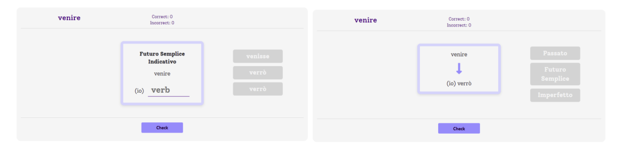
Figure 4: On the left, an example of the "Hint" button used during the "Conjugate" quiz gives the learner the option to select the correct verb form from one of the given choices to the right instead of typing it in. On the right is an example of the quiz type "Identify Tense"; the learner selects the correct tense from the choices given.

quiz and verb look-up features of Card-it most use ful . Yet, they suggested including translations and example sentences containing the individual verbs as it would be useful for students and teachers' perspectives.