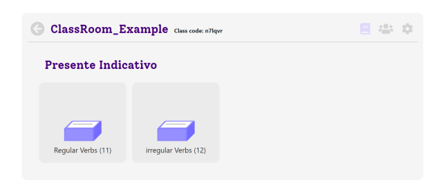
Figure 5: Example of a classroom with two collections and its entry code.

Fig. 5 shows an example classroom with two collections and the entry code for students to join the classroom: