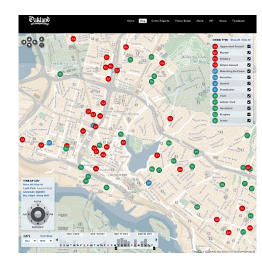
Figure 1: Oakland Crimespotting places crimes on the city map and provides interaction techniques to filter the crimes and access details [18].

Plurality. The data is arranged by location, date, time, and type of crime. However, the visualization does not allow the viewer to explore admittedly difficult questions