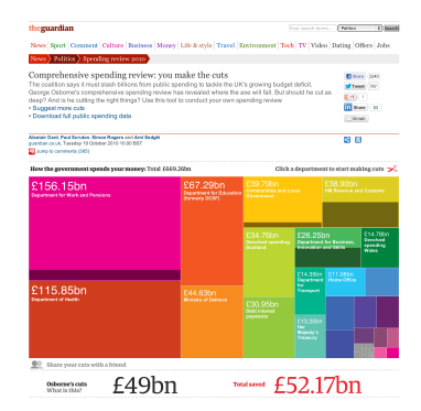
Figure 3: You Make the Cuts allows the viewer to specify spending cuts of a national budget [5].

national budget of Britain needs to be reduced. The visualization details the exact spending figures for each governmental department. An article that is linked from the visualization explains how the 49 billion British pounds to be cut comes about. The visualization provides a link to a page with details about the underlying data.